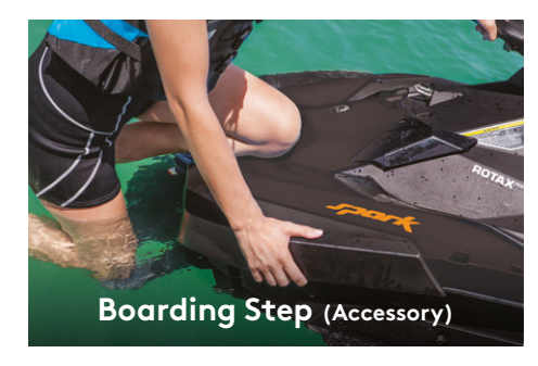
Makes boarding from the water easier and quicker.