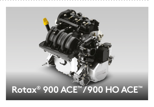
Two fuel efficient, compact and lightweight Rotax® engine options.