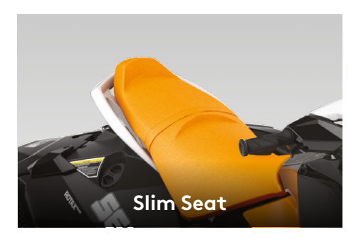
Designed to improve freedom of movement while riding.