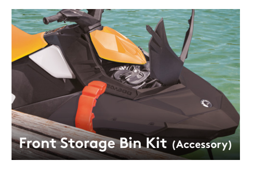
Additional storage space to bring more gear on board.