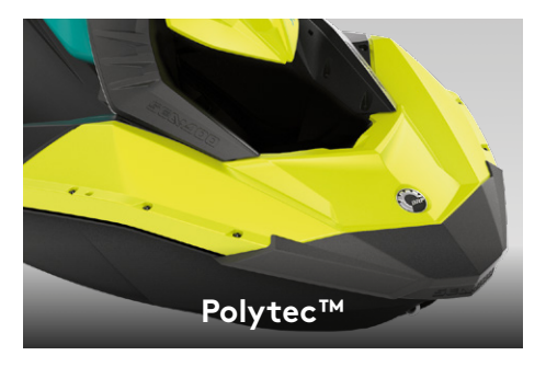
Innovative material that reduces weight while optimizing performance and efficiency. The color-in molding is more scratch-resistant than fiberglass.